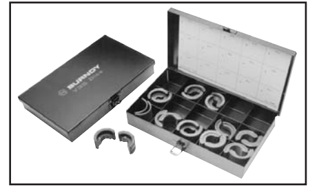
U die case Part# PT29291 , holds up to 15 dies