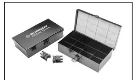
W die case Part# PT4946 , holds up to 12 dies