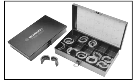
U die case Part# PT29291 , holds up to 15 dies