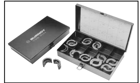
U die case Part# PT29291 , holds up to 15 dies